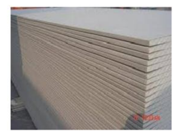
Fig 1. Gypsum powder and gypsum boards.