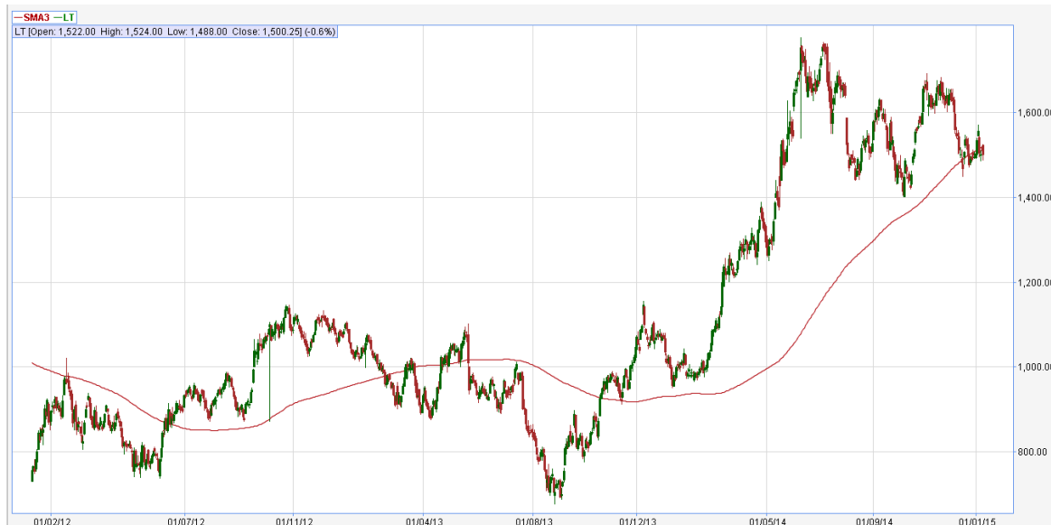
LT chart with 200day moving average line

For analysis we have taken Larsen & Toubro candle stick chart data for past 3 years.