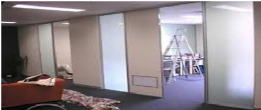
Fig 5. Light weight gypsum panels.

The walls between two chambers or rooms are usually built with cement products, since heat and noise transfers easily through it. The natural fibers gypsum composites can reduce heat loss from one place to another.