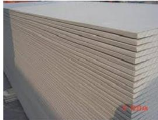
Fig 1. Gypsum powder and gypsum boards.