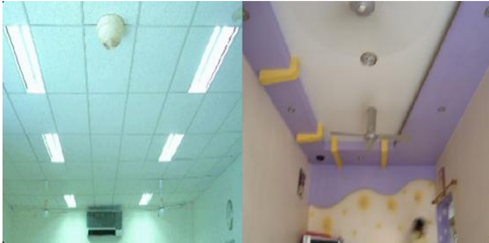
Fig 4. False ceiling with light and air vents.