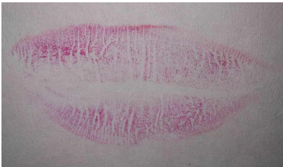
Figure 4 showing the branched pattern Type II