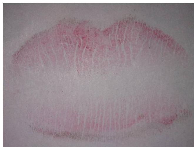
Figure 2 showing the branched groove Type III pattern