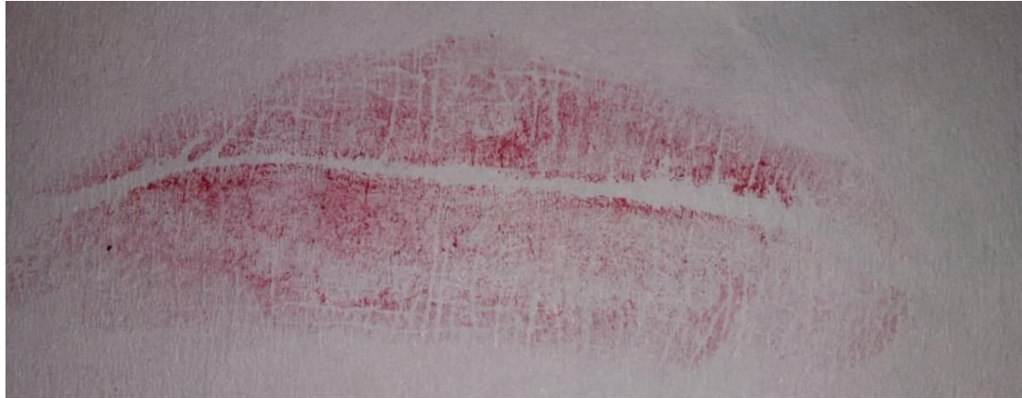
Figure 3 showing the reticulate pattern Type V